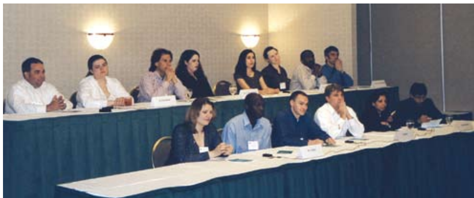
The Kentucky Academy of Family Physician's Second Annual Resident Quiz Bowl participants.